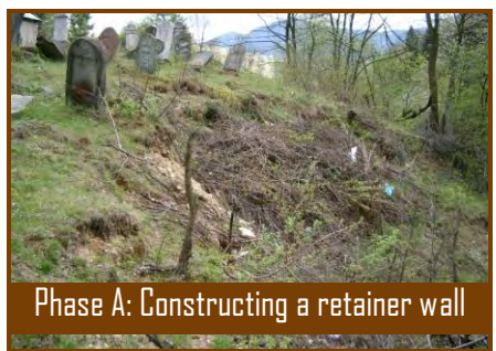
Phase A: Constructing a retainer wall

Upon hearing a first hand report of the dire condition of the cemetery, the esteemed descendants immediately donated astronomical sums to enable the construction of a retainer wall and keep the grounds from further deterioration. May the great merit stand in good stead.